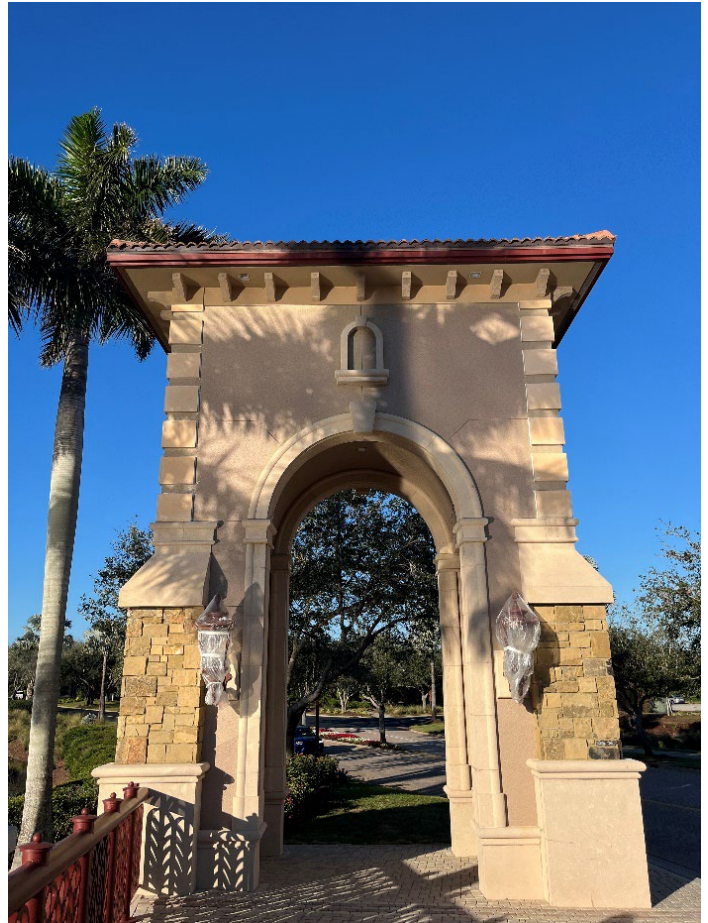
Bridge lights covered during painting.