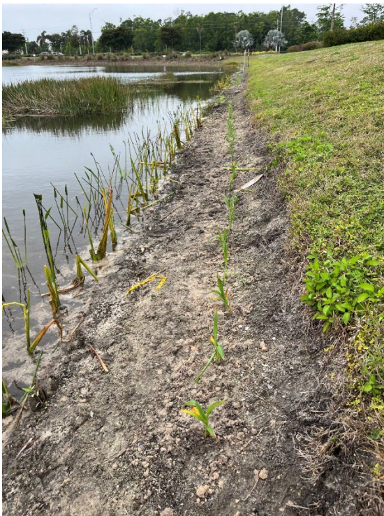
Littoral plantings Lake #1