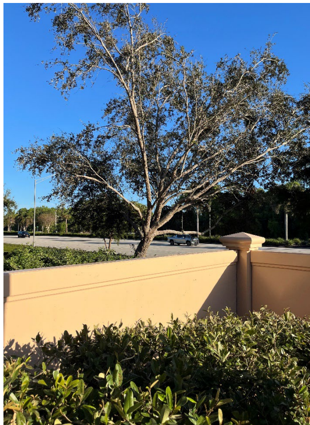
Painting of the main entrance progress.