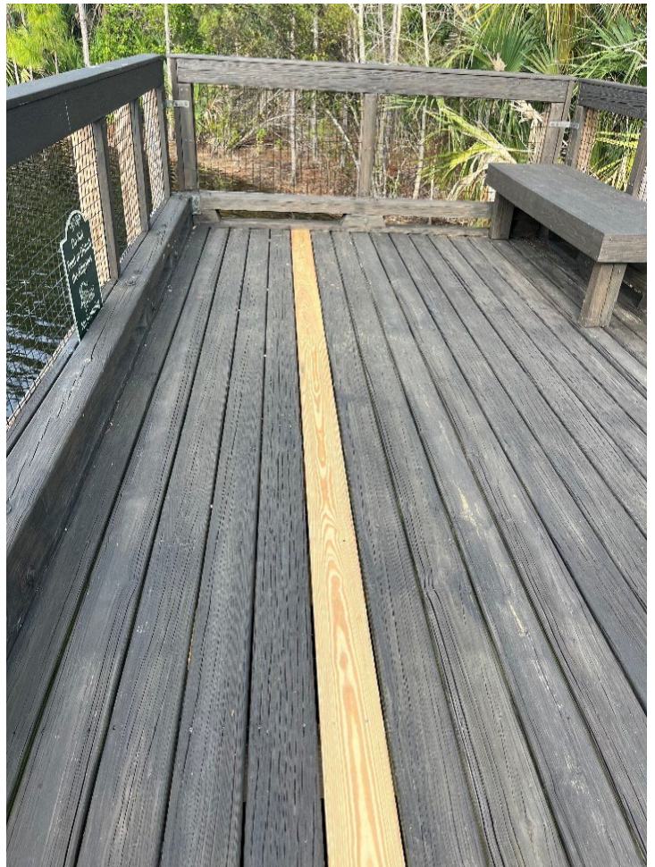
New board installed.