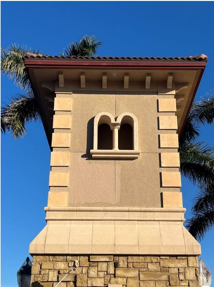
Painting in progress at the entrance.