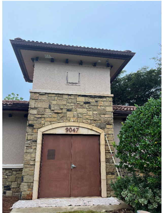
Painting of the main entrance progress.