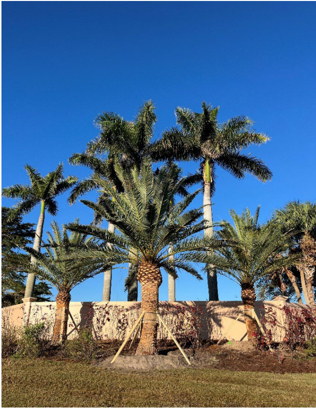
3 New Canary Date Palms Installed