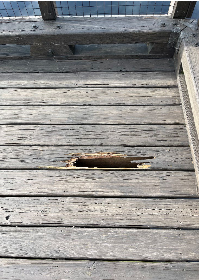
Hole in the wood on boardwalk