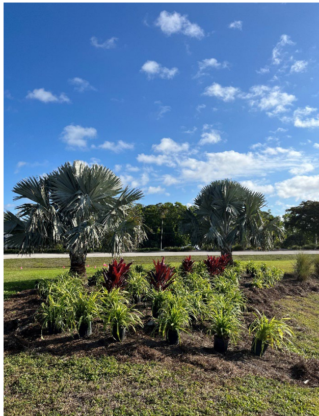
New plantings around the Bismark on the West end near US 41.