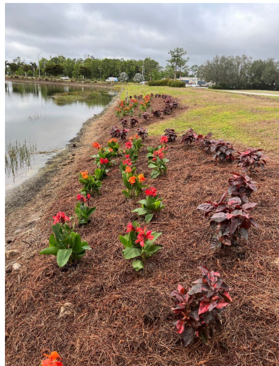
New plantings installed by Lake #1