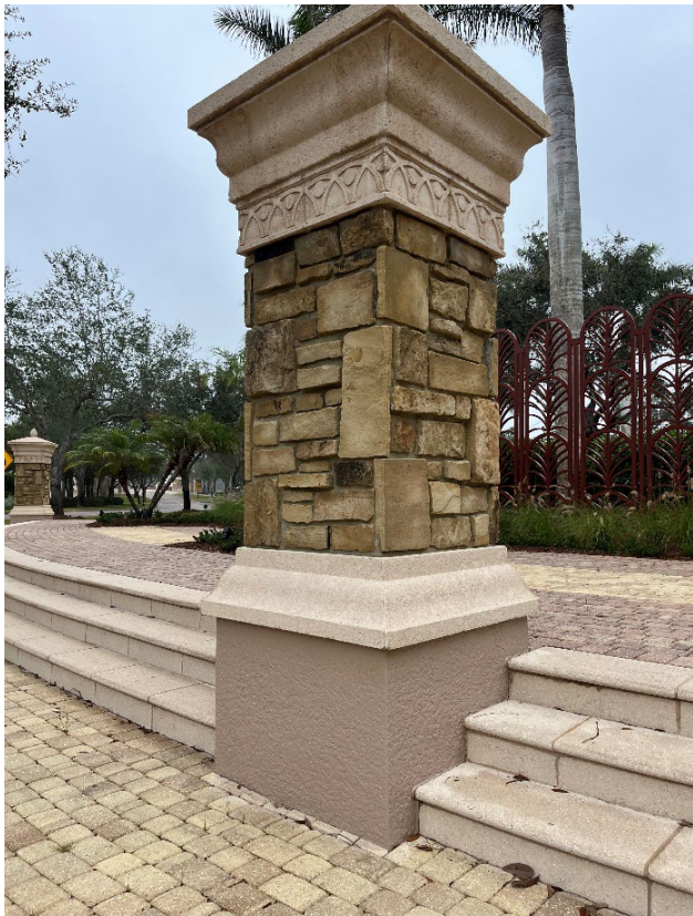
Painting of the main entrance progress.