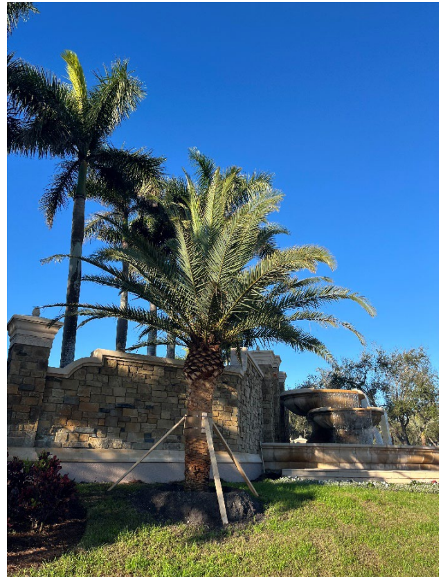
Canary date palms installed on the side of the fountains