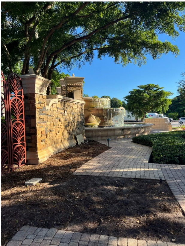
Landscape enhancement plan phase 1