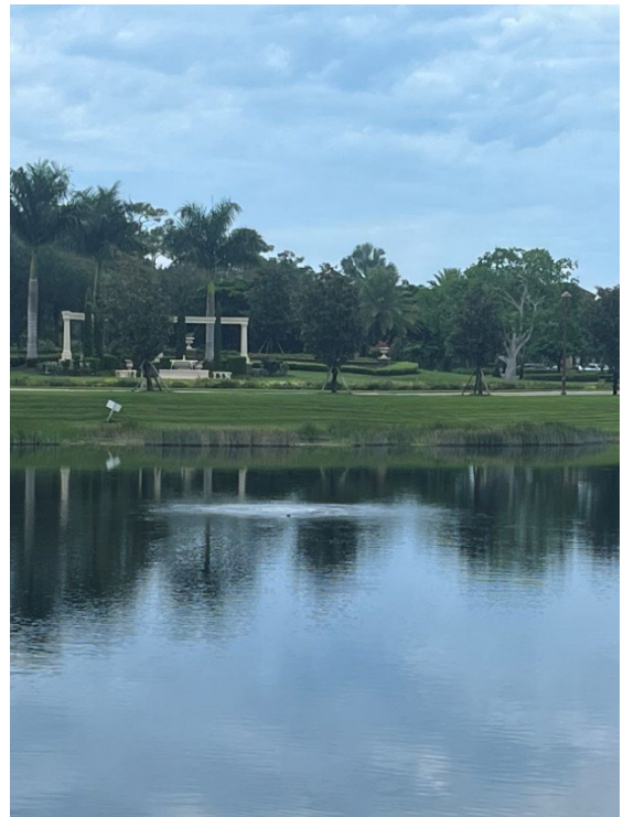
Lake 7 air diffuser running.