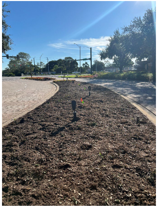
After Oak Trees were removed.