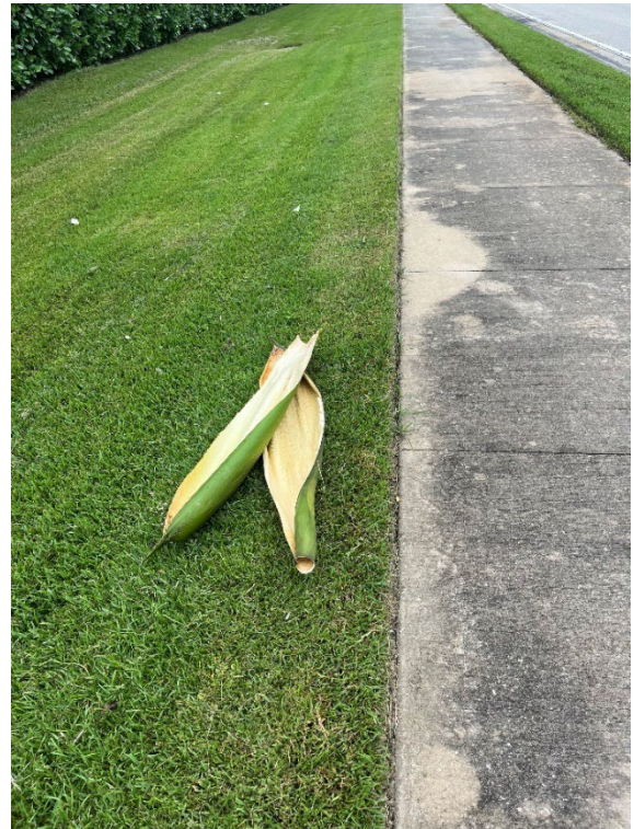
Fronde placed to be picked up on Southwest Blvd