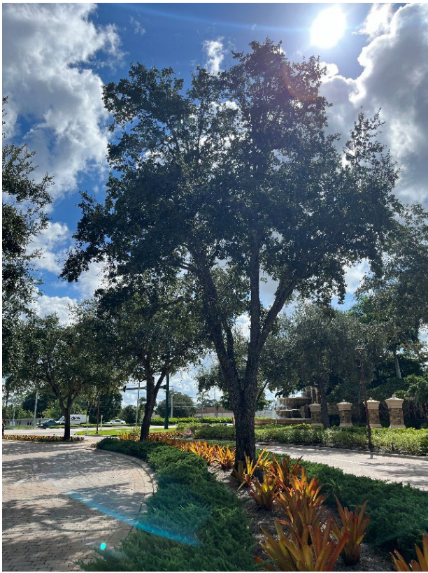
Before Oak Trees were removed