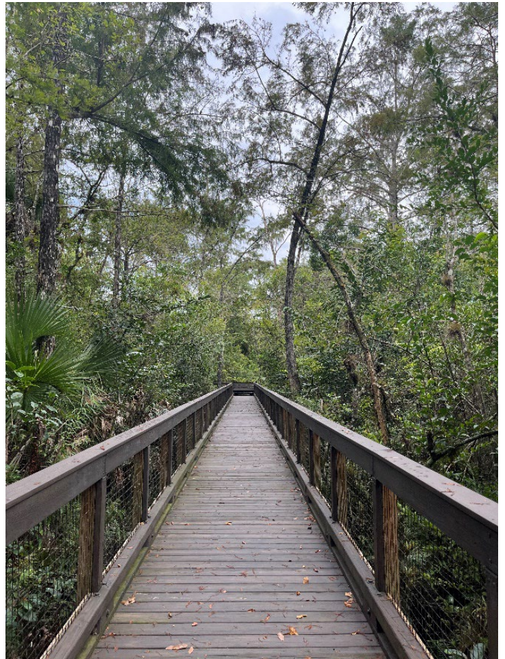
Boardwalk being constantly monitored.