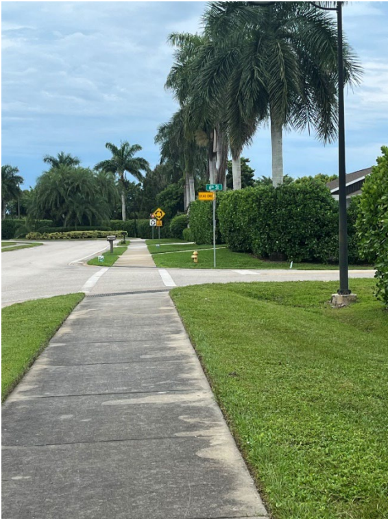
Continuous lawn maintenance on Southwest Blvd.