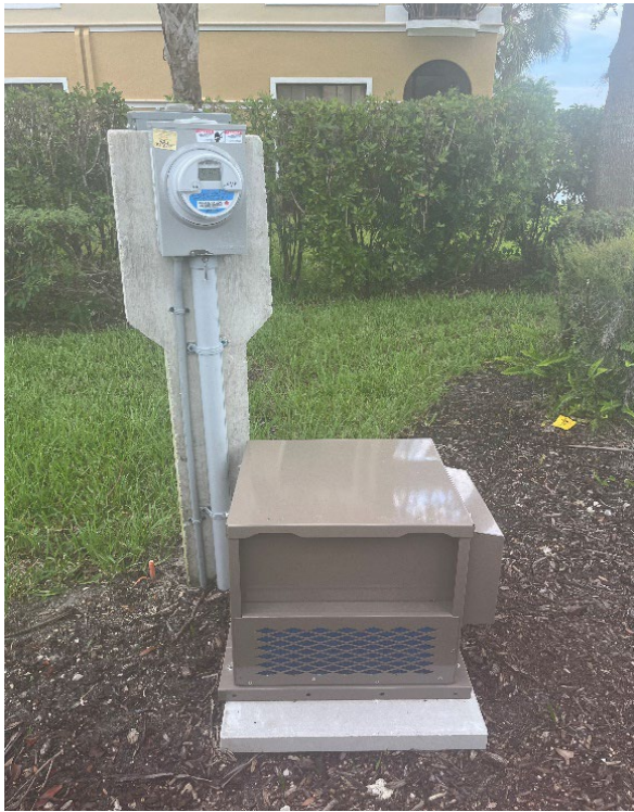
Aeration system completed