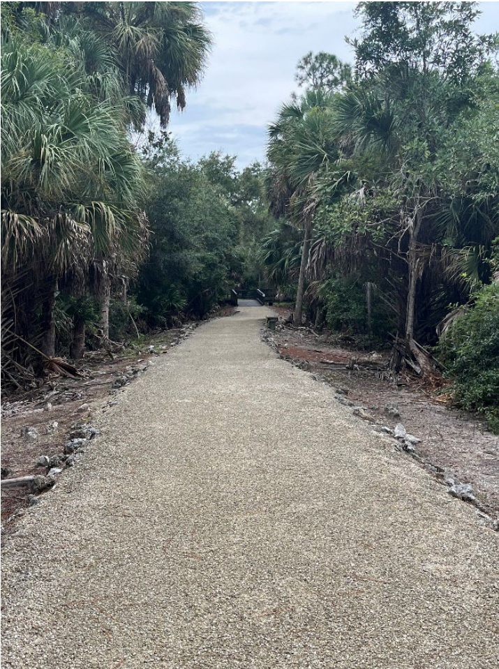
Path to boardwalk clear of any debris