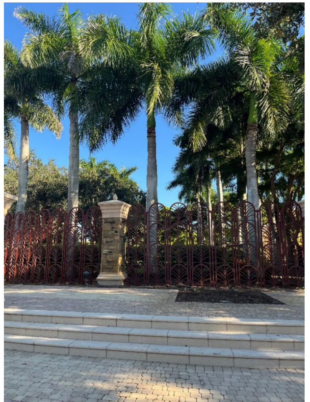
Phase 1 view of the decorative fencing.