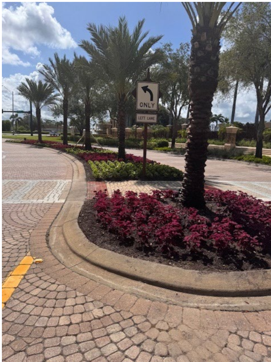
New Annual Rotation