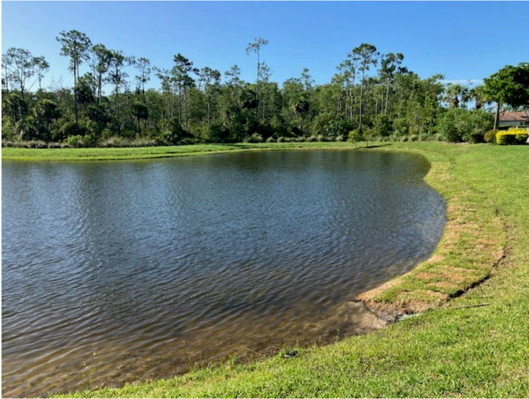
Trevi Lake Bank Restoration