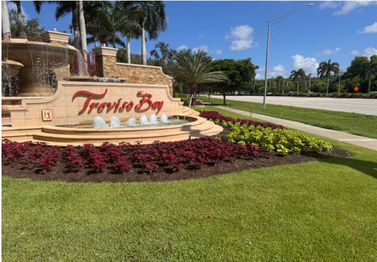
New Annual Rotation