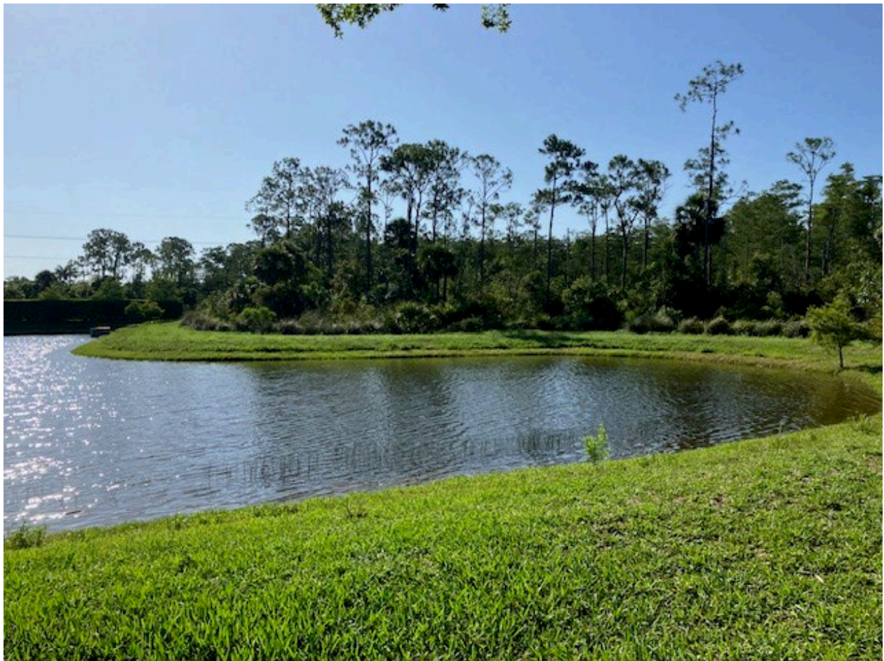
Trevi Lake Bank Restoration