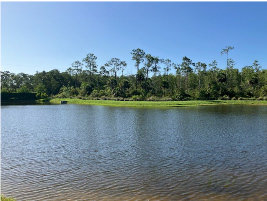
Trevi Lake Bank Restoration