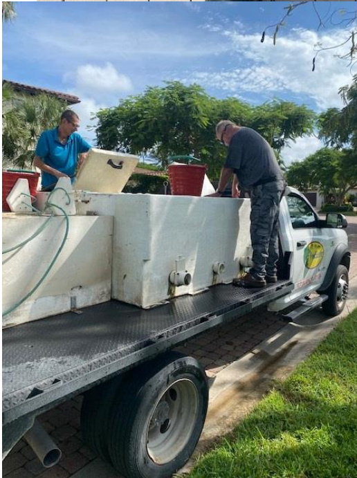
Solitude stocking grass carp (Peninsula marina area)