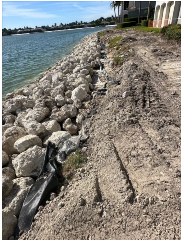
Riprap repair in the Ravenna community.