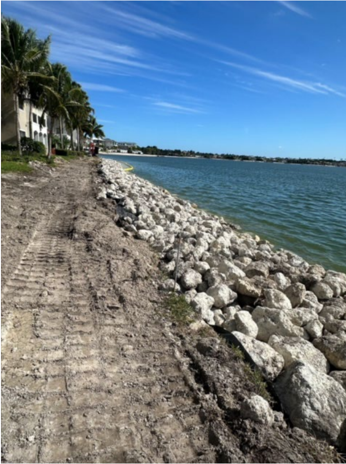
Riprap repair in the Ravenna community.