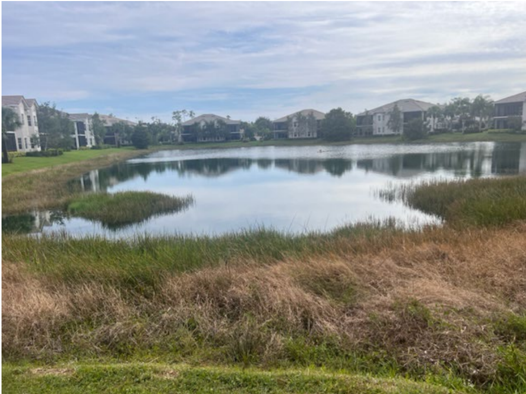
Grasses that need attention in San Marino Lake.