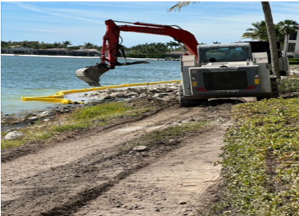
Riprap repair in the Ravenna community.