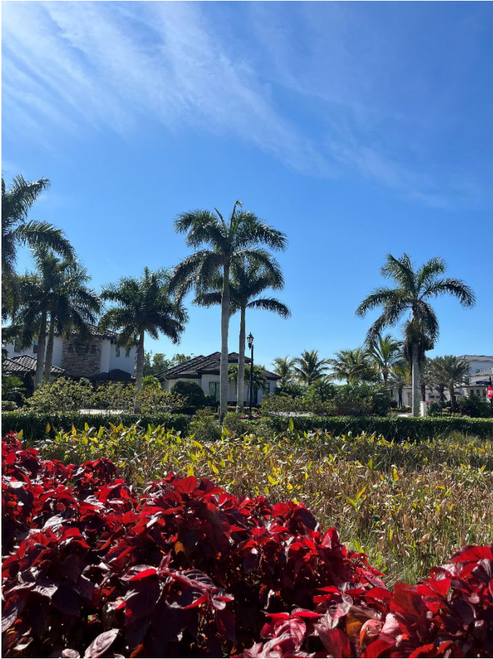
Landscape retention and retention areas are being maintained and inspected constantly.