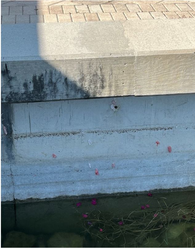
Apple snails before removal