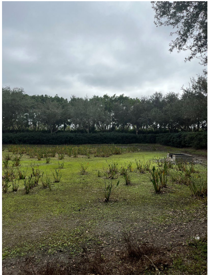
Landscape retention and retention areas are being maintained and inspected constantly.