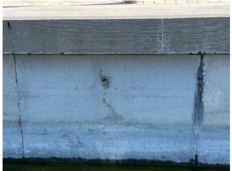
Apple snails removed on sea wall.