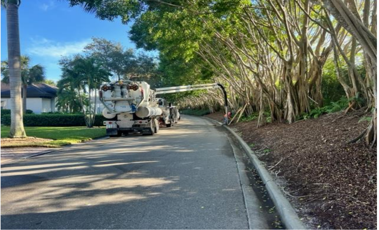
Miromar Lakes – Identifying video recordings