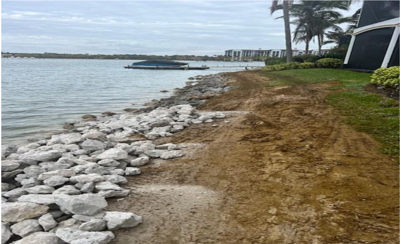
Iolsabella Riprap Repair