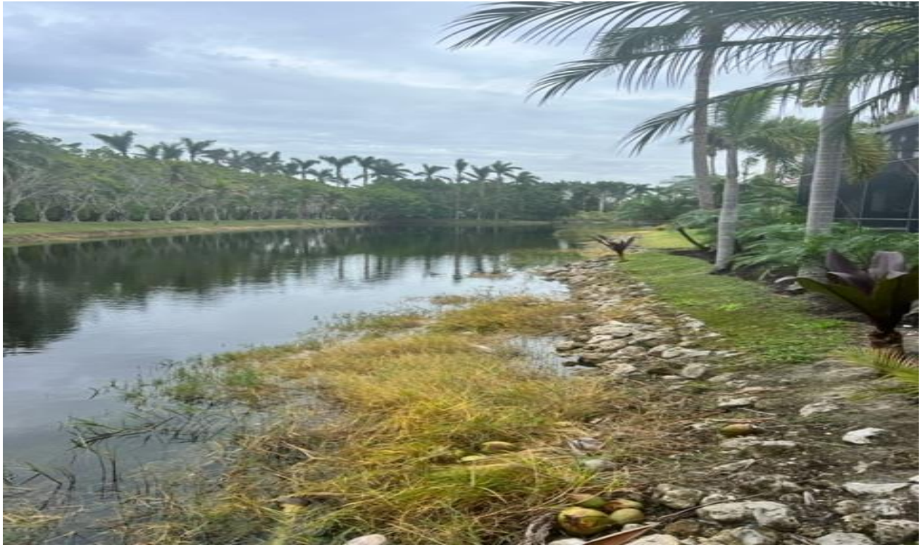
Lake 6 Treated Weeds