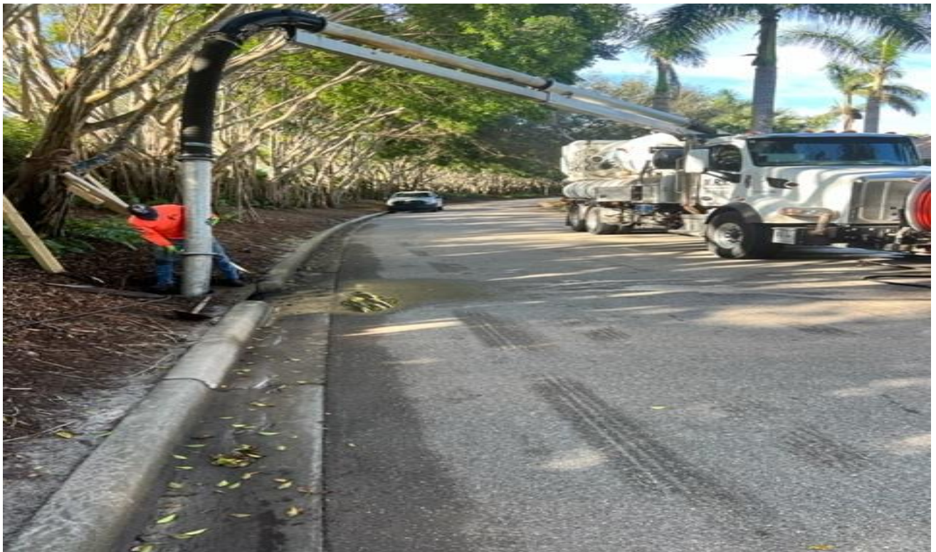
Miromar Lakes – Identifying video recordings