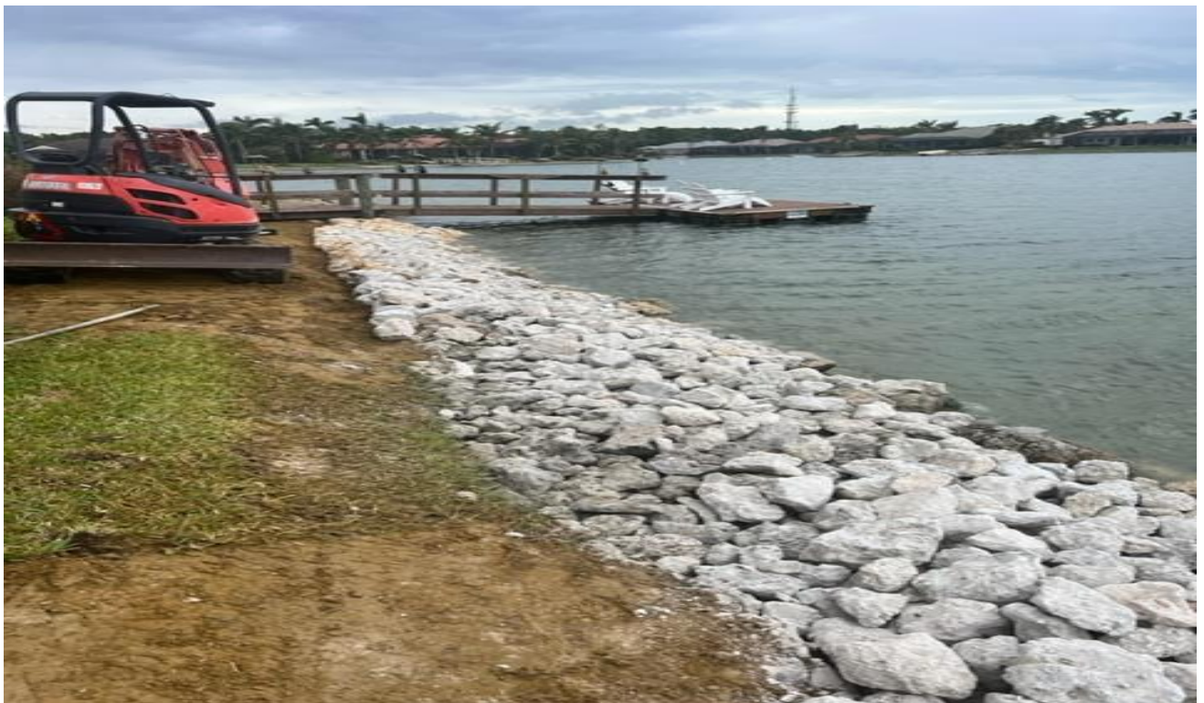
Iolsabella Riprap Repair