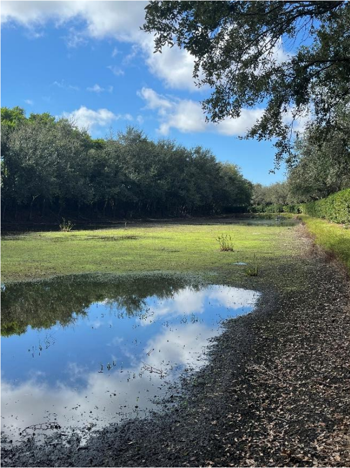
Landscape retention and retention areas being maintained and inspected constantly.