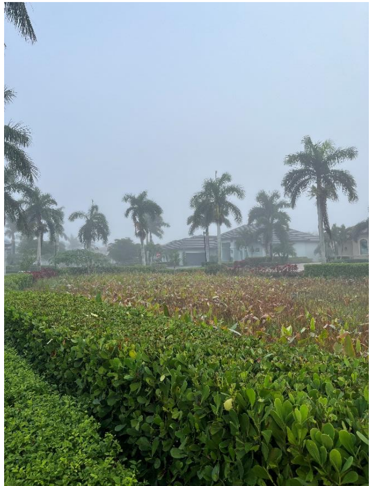
Landscape retention and retention areas being maintained and inspected constantly.