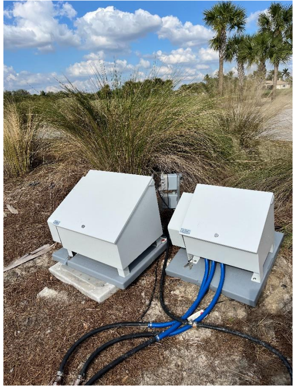
New cabinets for the aeration system.