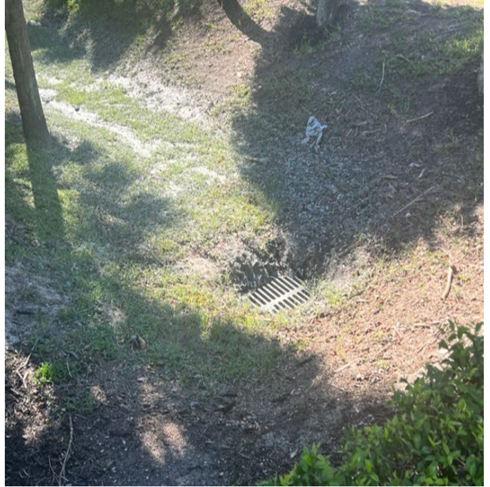
Retention Area Near Volleyball Courts