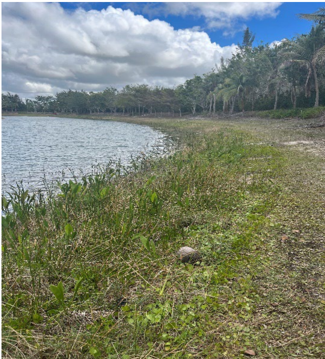
New Aquatic Plantings