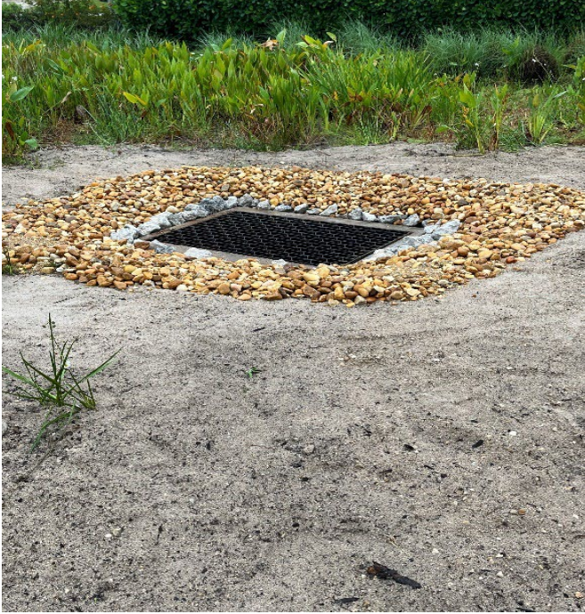
Laguna Retainage Area