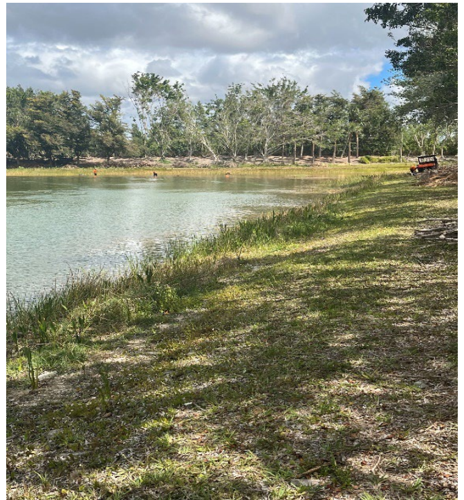
New Aquatic Plantings