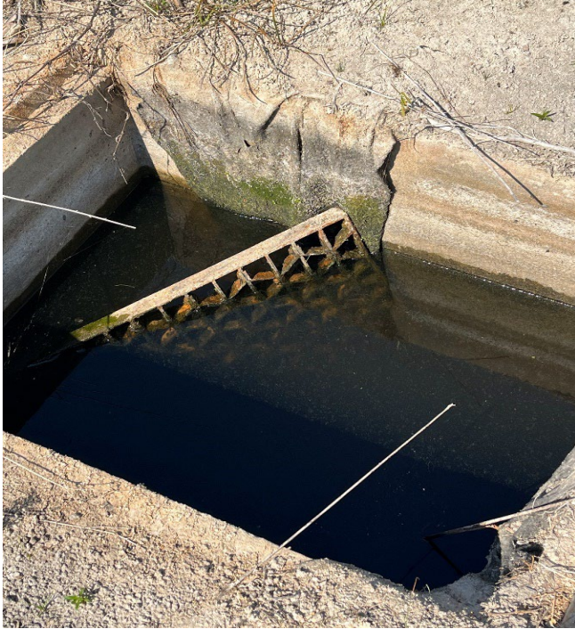
Laguna Catch-Basin Grate