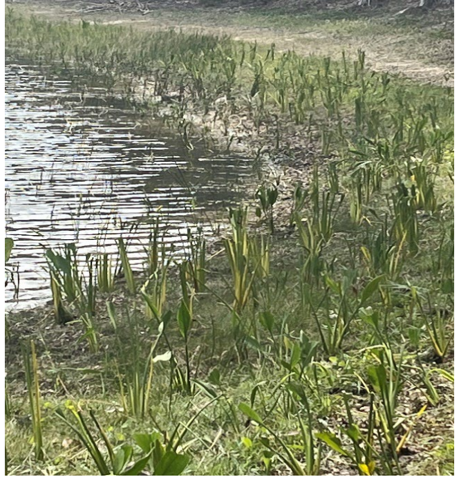
New Aquatic Plantings