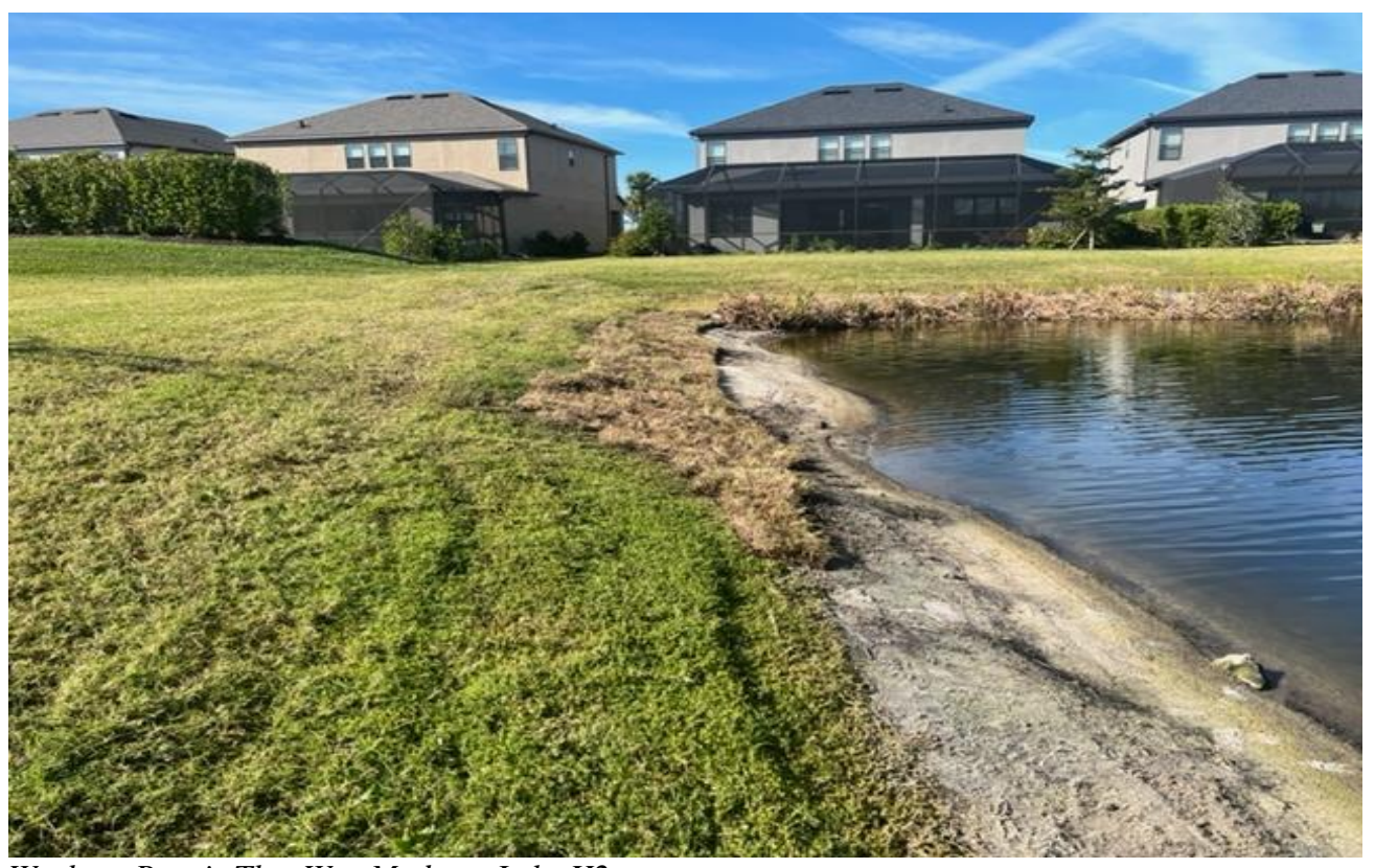
Washout Repair That Was Made on Lake H2