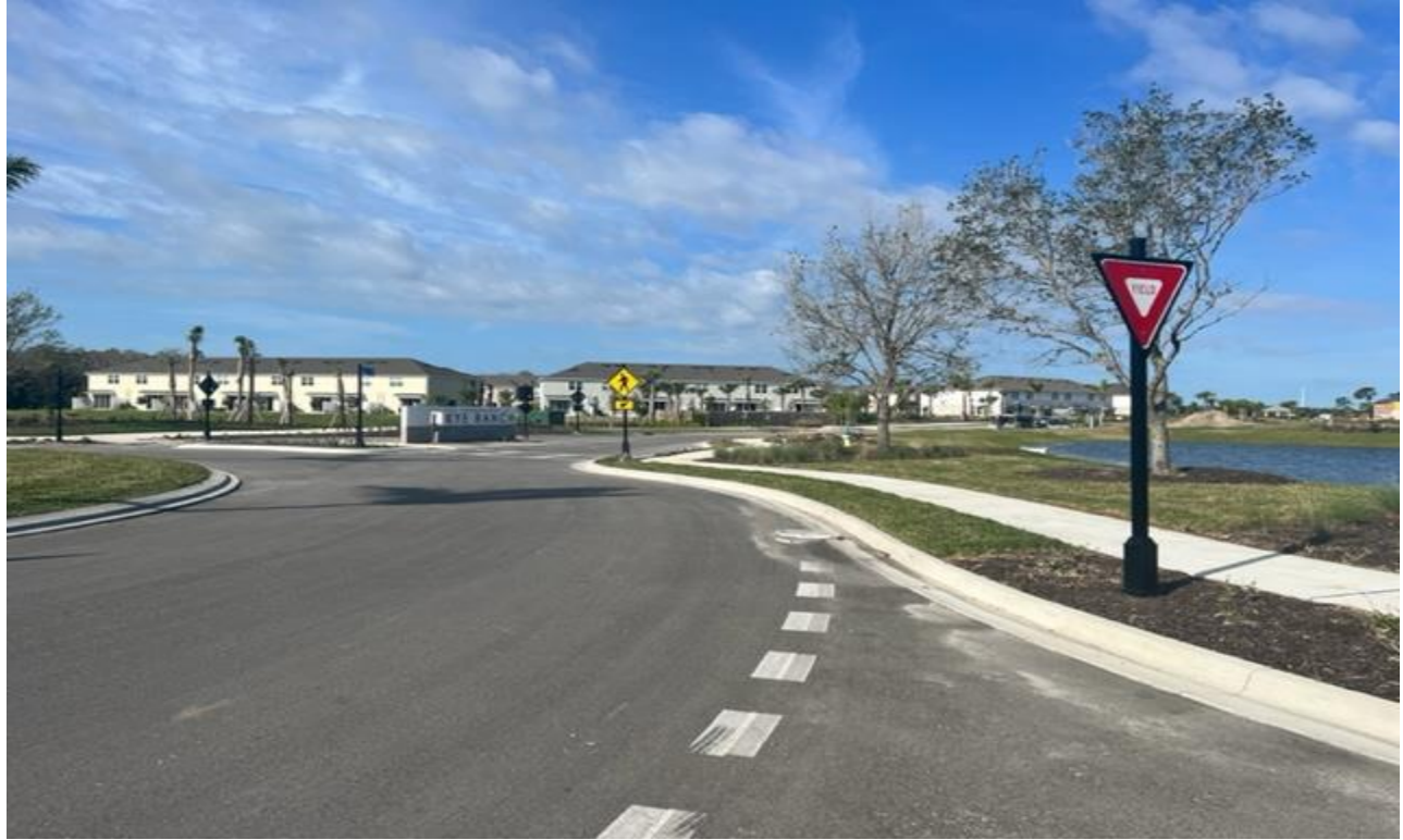
Neighborhood 4 Townhomes ROW