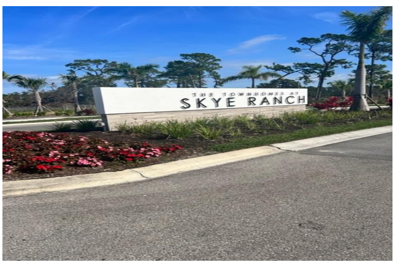
Neighborhood 4 Townhomes ROW