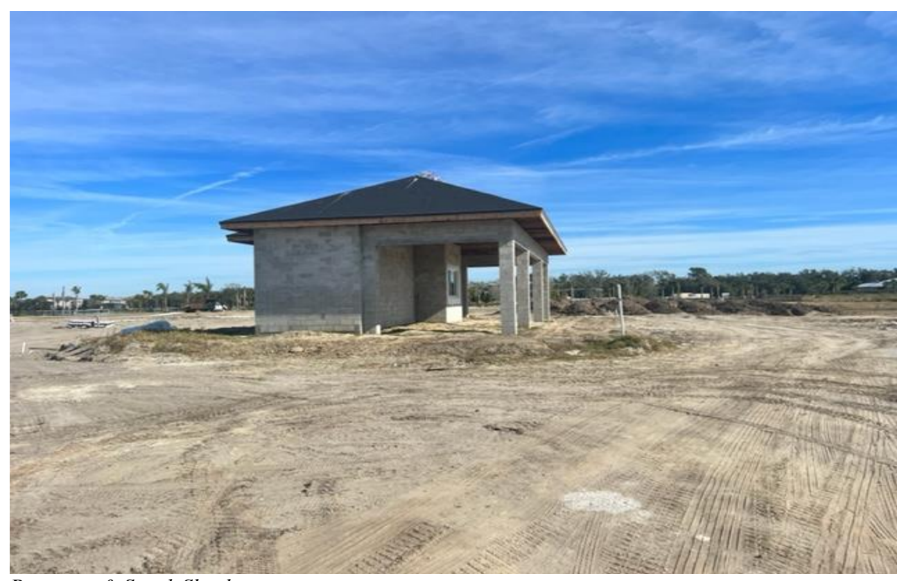
Restroom & Snack Shack