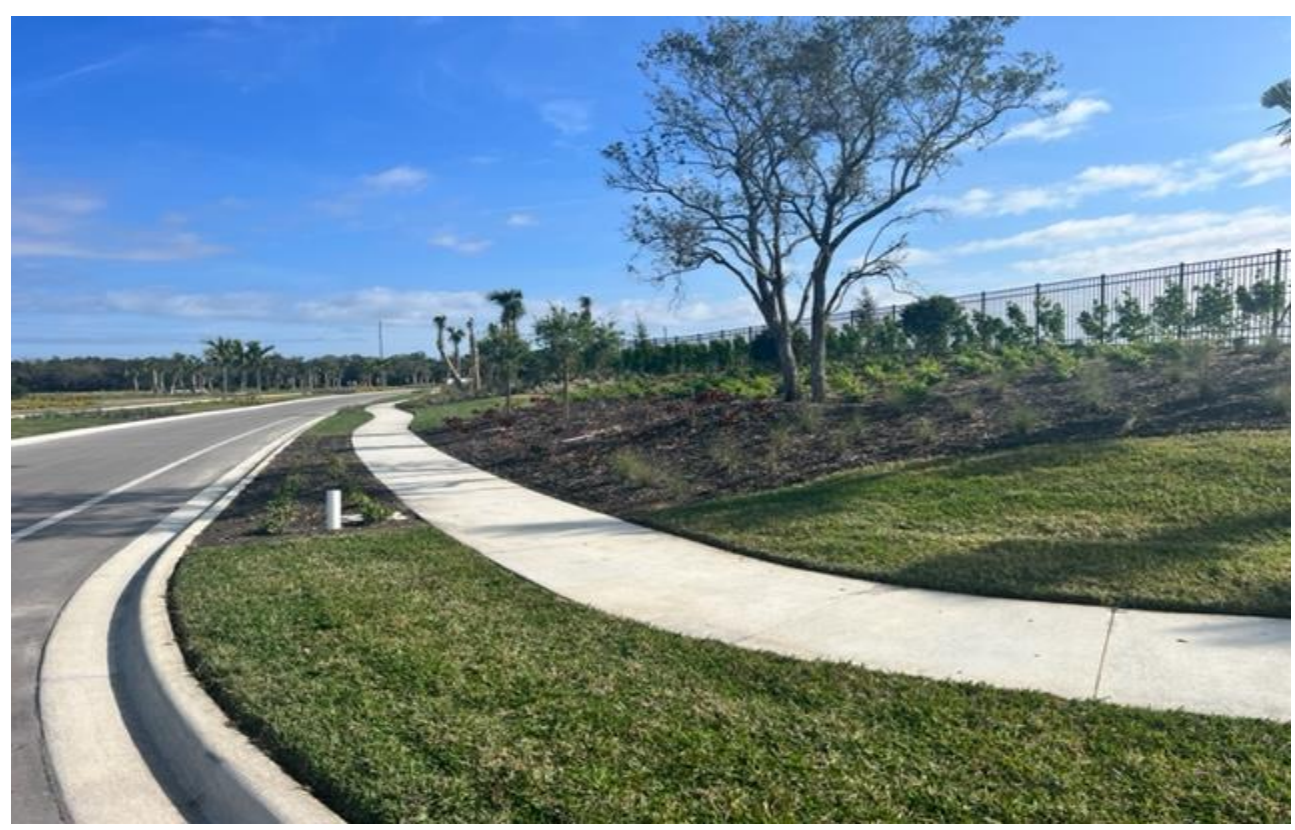
Neighborhood 4 Townhomes ROW