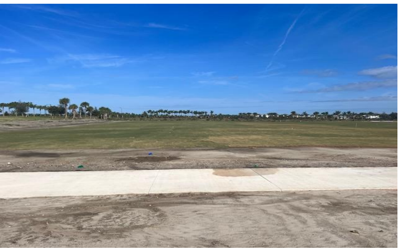
Turner Park Soccer Field