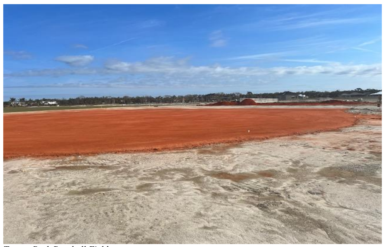
Turner Park Baseball Field