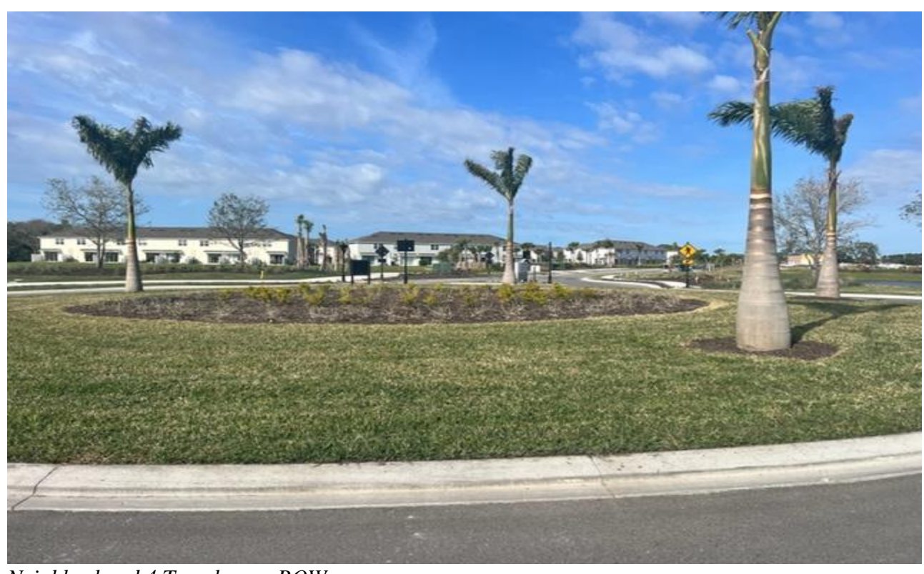
Neighborhood 4 Townhomes ROW