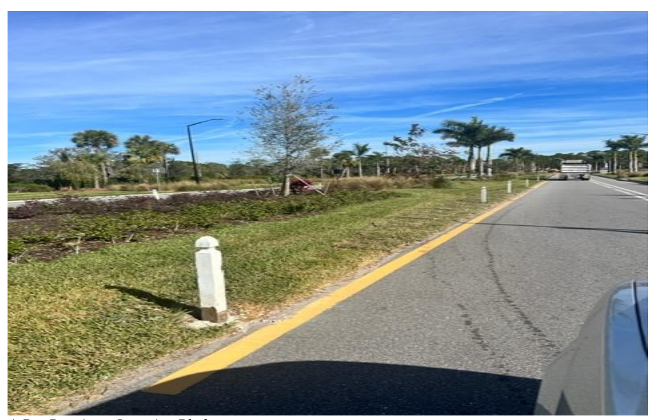
A Rut Repair on Lorraine Blvd.