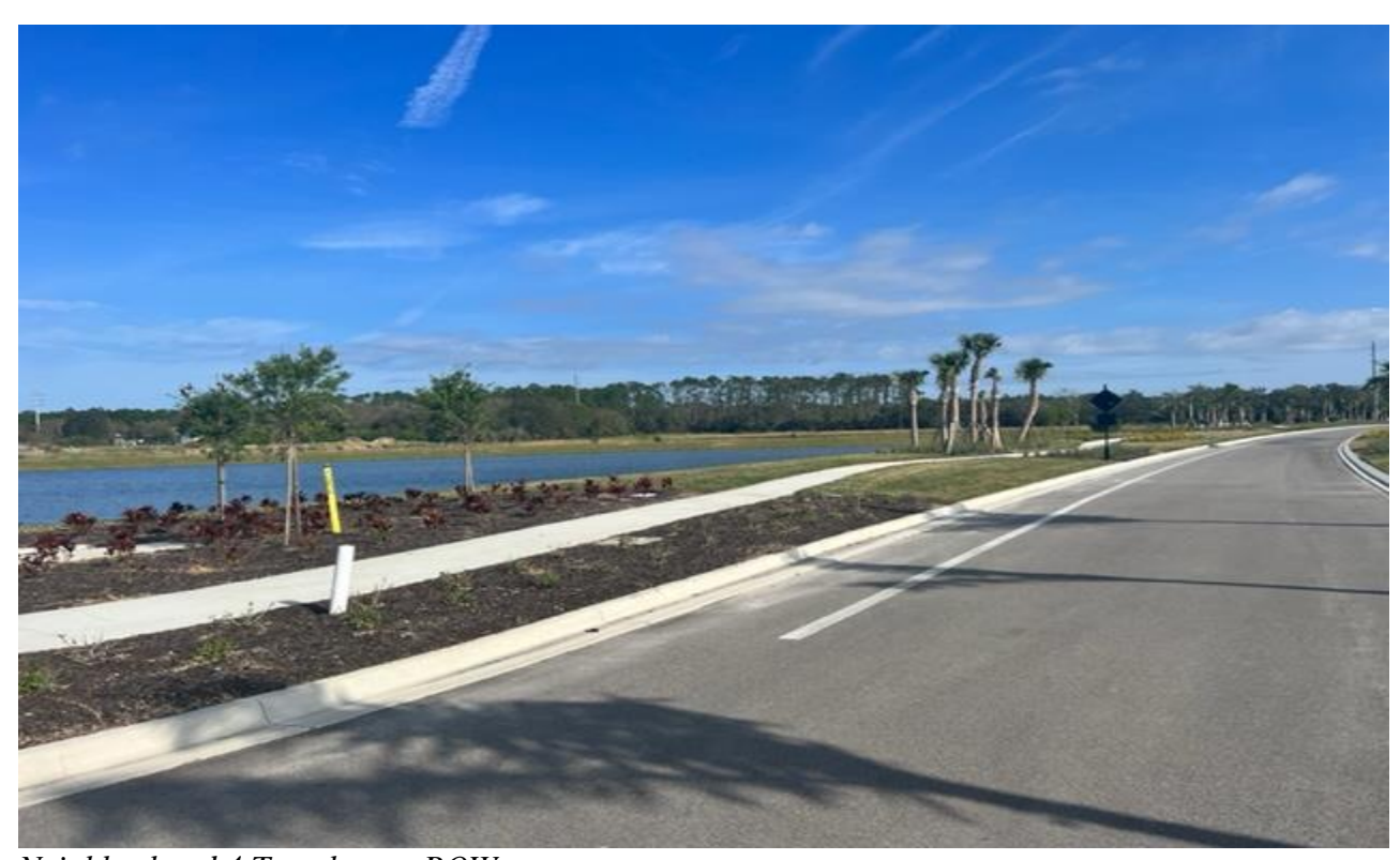
Neighborhood 4 Townhomes ROW