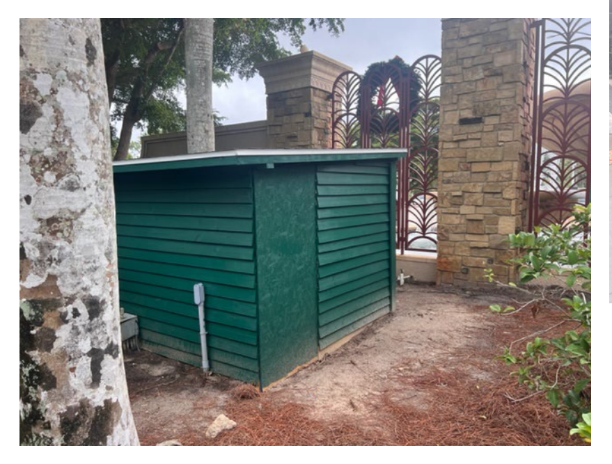
Recently painted pump house located at west side of the main entrance.