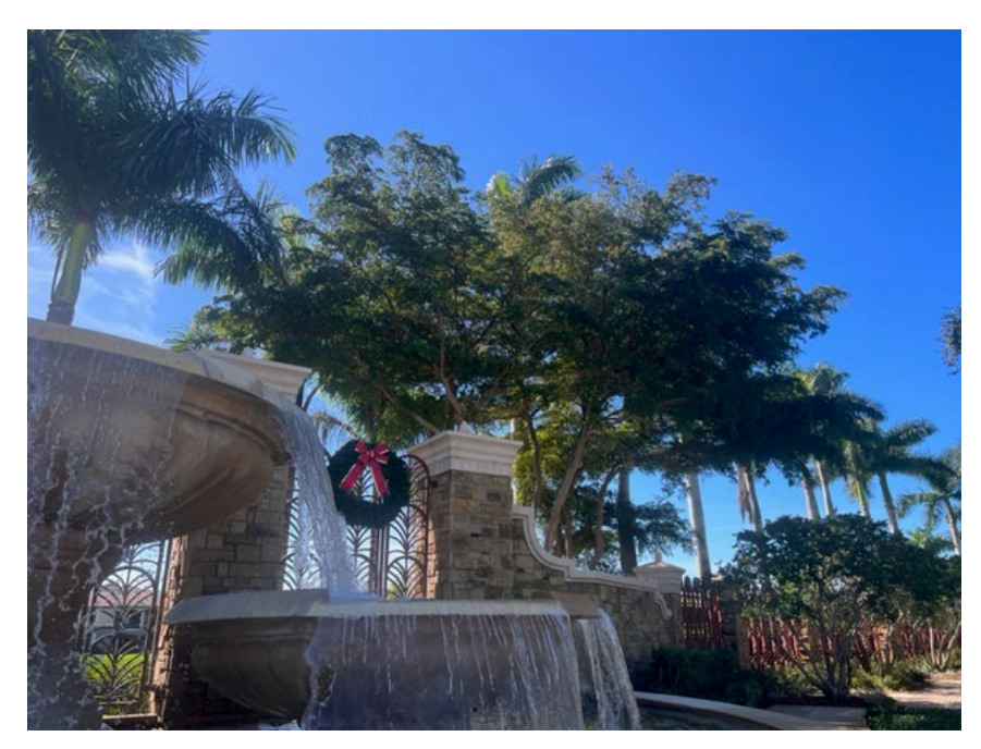
Black Olives trees that were recently thinned at the front entrance.