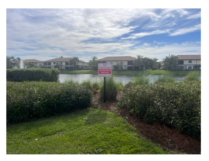
New No Tresspressing sign that was installed on Lake 1.