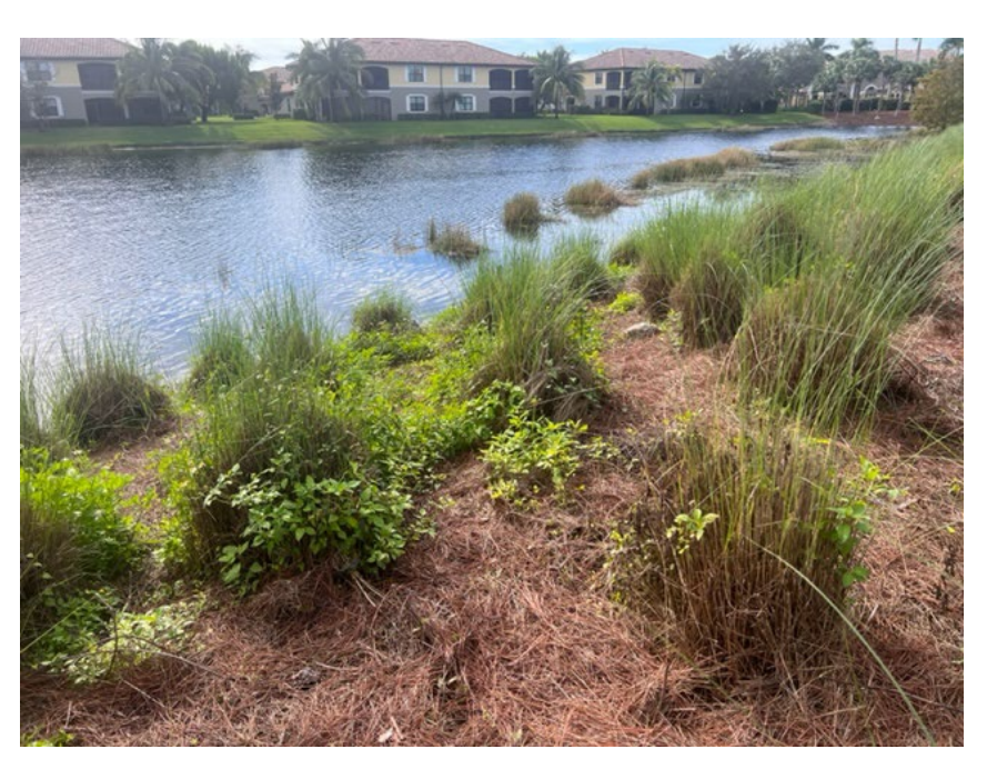
Weeds along lake 2 that continue to be an issue.