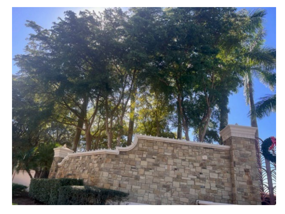
Black Olives trees that were recently thinned at the front entrance.