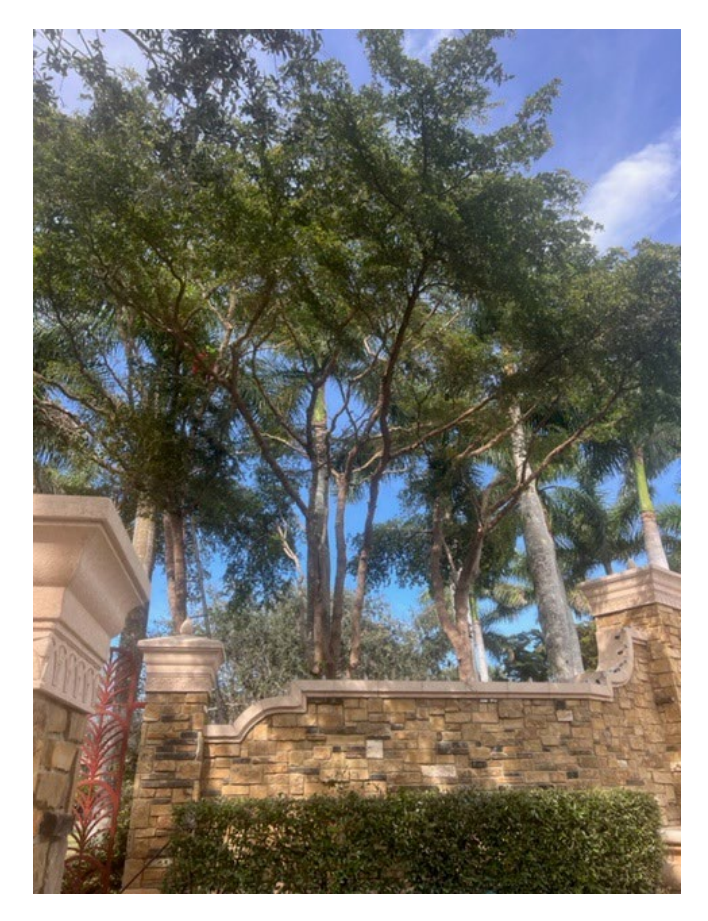
Black Olives trees that were recently thinned at the front entrance.