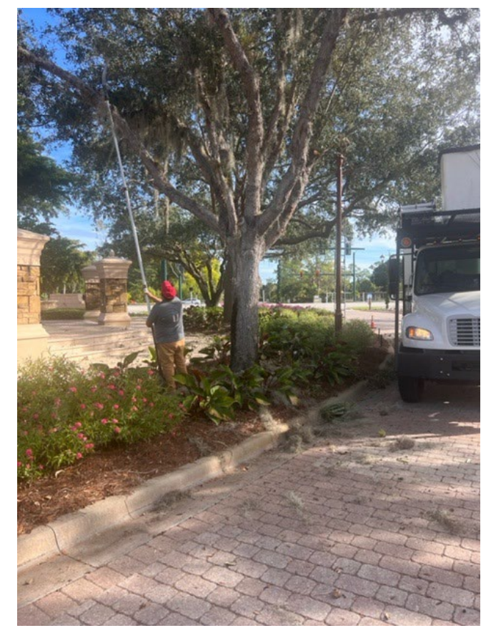
Spanish Moss that is being removed from the oak trees at the front entrance.