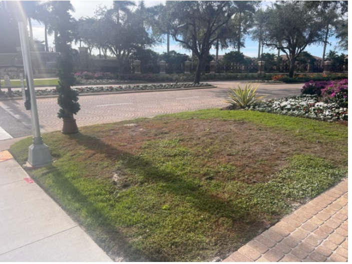
Bermuda grass that needs to be replaced at the front entrance.