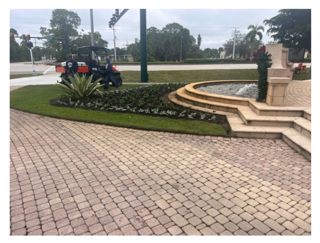
Newly installed annuals at the main entrance.