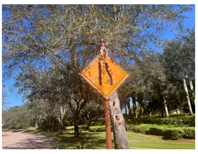
Reflective sign, that is scheduled to be replaced at the end of December.