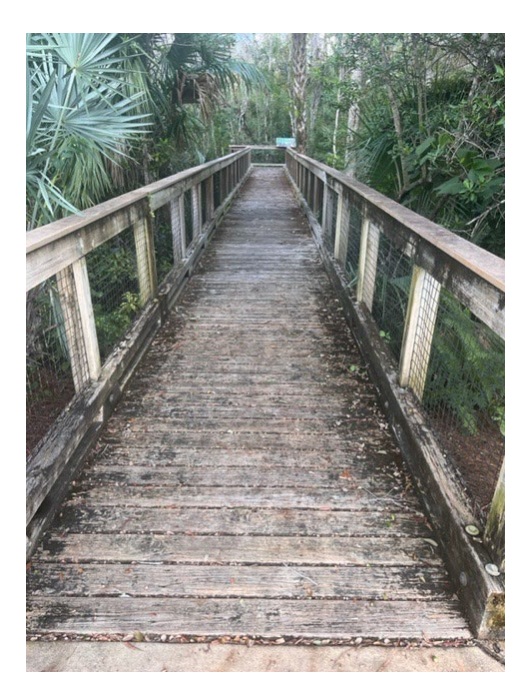
Boardwalk in the preserve area that is scheduled to be pressure cleaned.