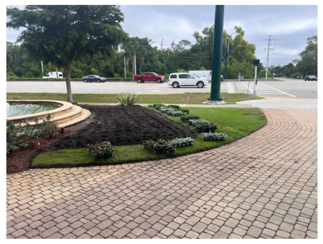
Newly installed annuals at the main entrance.