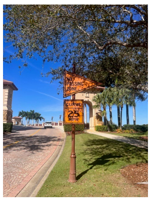
Reflective sign, that is scheduled to be replaced at the end of December.