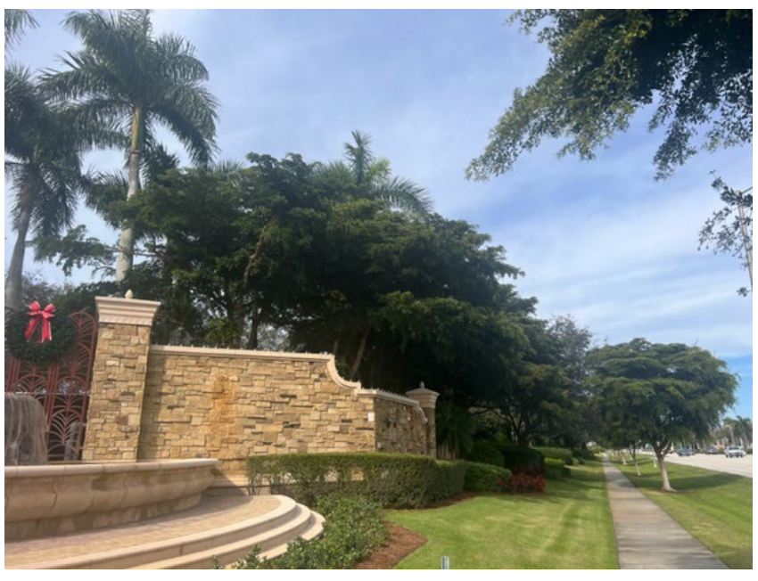
Black Olives trees before they were recently thinned at the front entrance.