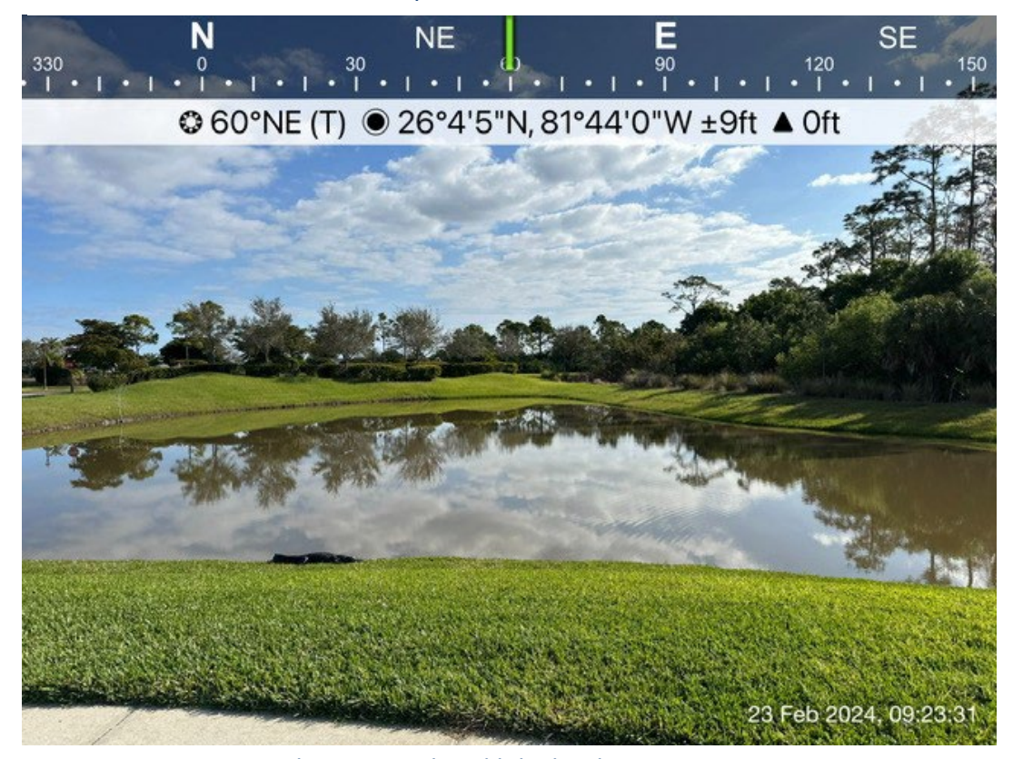
Lake 29 completed lake bank restoration.