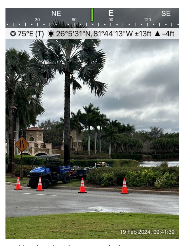
Vendor cleaning storm drain structures.