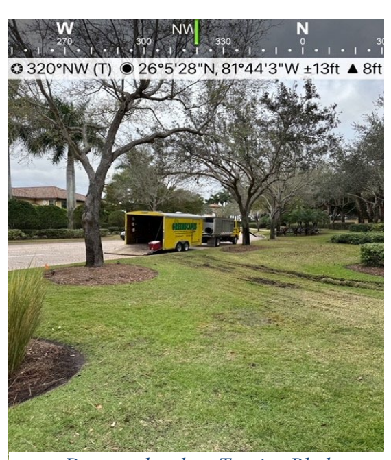
Damaged sod on Treviso Blvd