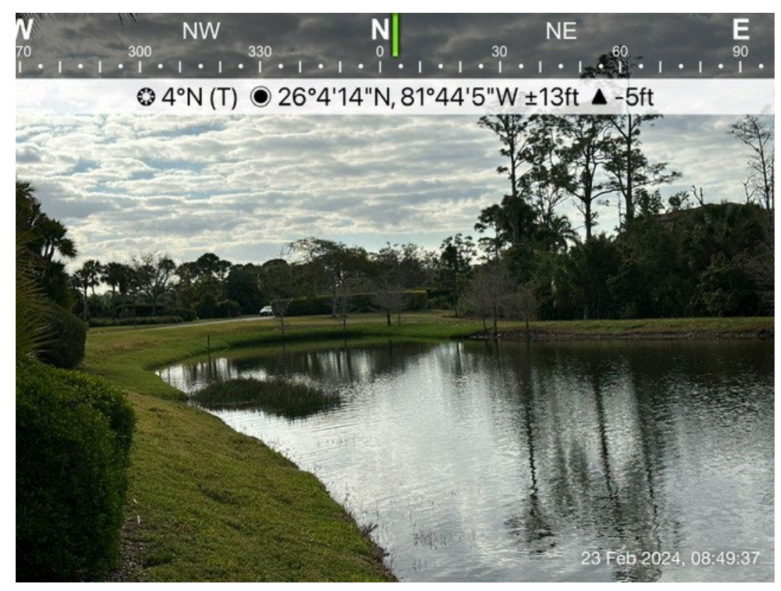
Lake 26 completed lake bank restoration.