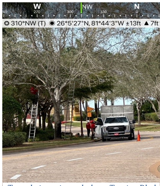
Trees being trimmed along Treviso Blvd

Landscape vendor mowed grass, and trimmed hedges along Southwest Boulevard. Maintenance is ongoing and occurs every other week.