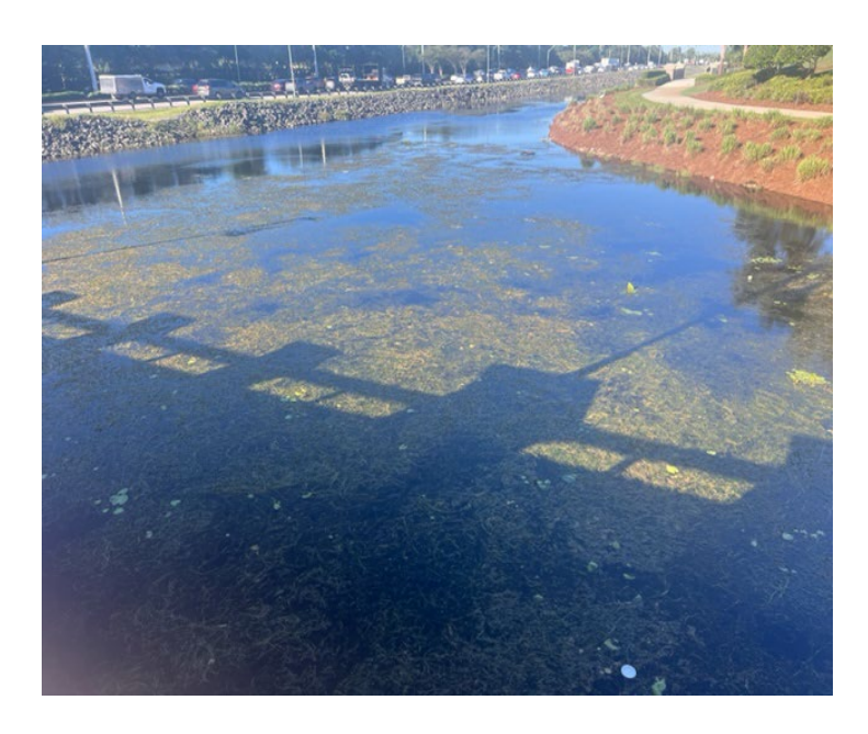
Before South Florida Water Management cleaned the canal system.