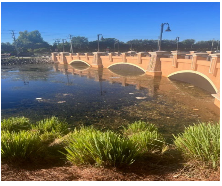
Before South Florida Water Management cleaned the canal system.