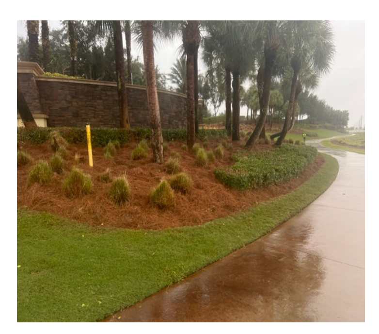
New pine straw mulch at the front entrance.