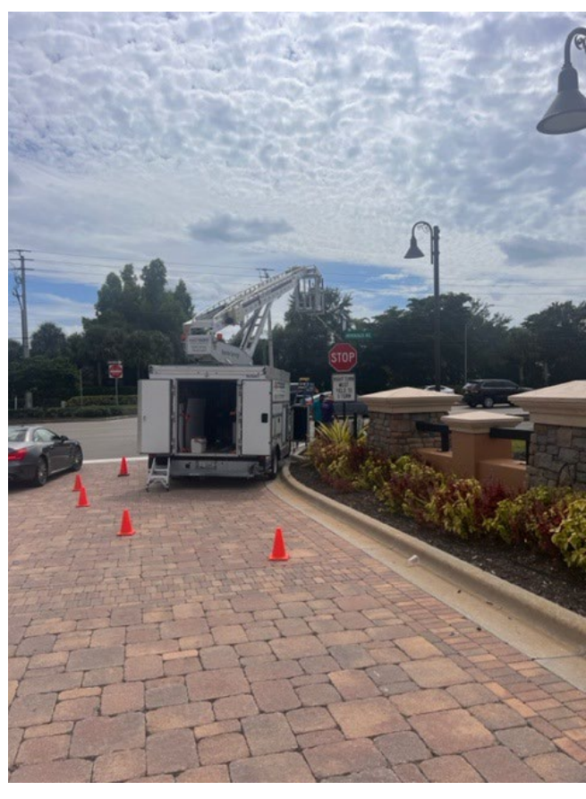
Stop sign being realigned at the front entrance.