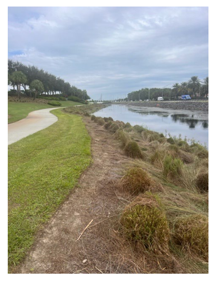
Recently trimmed grasses along the canal bank at the front entrance.