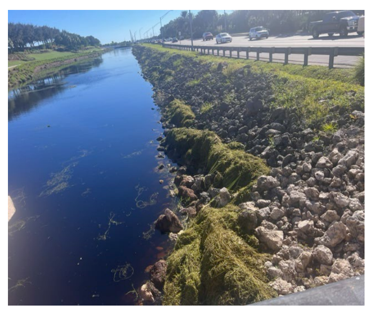
After South Florida Water Management cleaned the canal system.