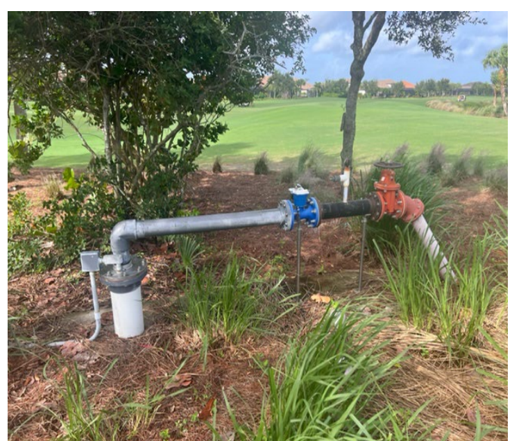
The new well pump installed near hole 11.