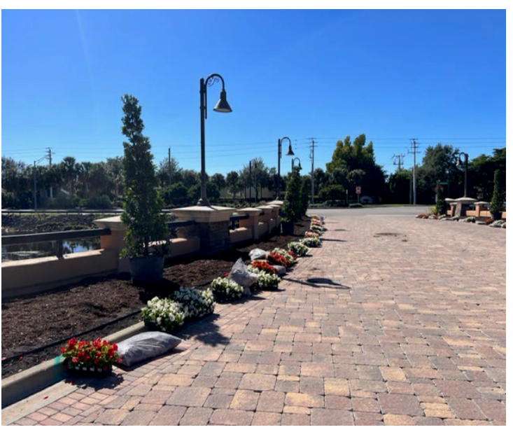
New annuals at front entrance.