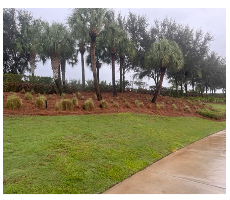
New pine straw mulch at the front entrance.