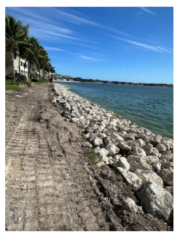
Riprap repair in the Ravenna community.