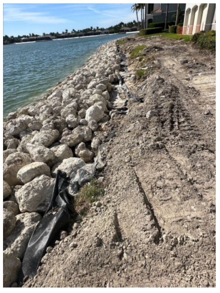
Riprap repair in the Ravenna community.