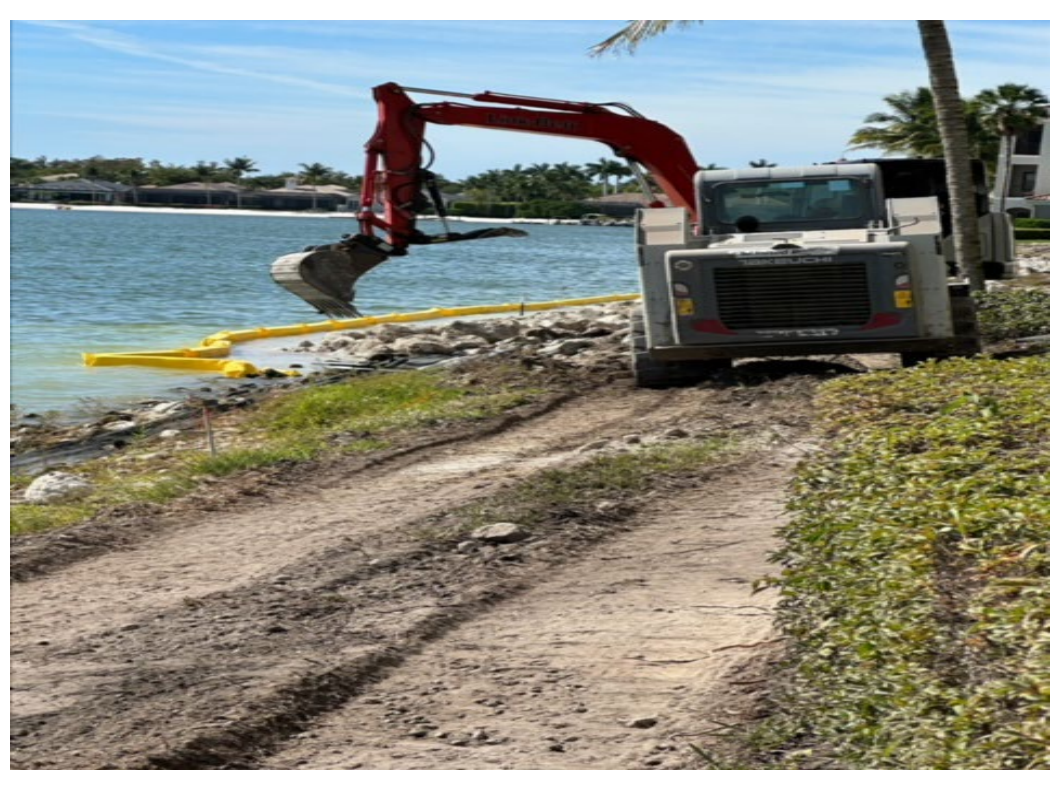
Riprap repair in the Ravenna community.