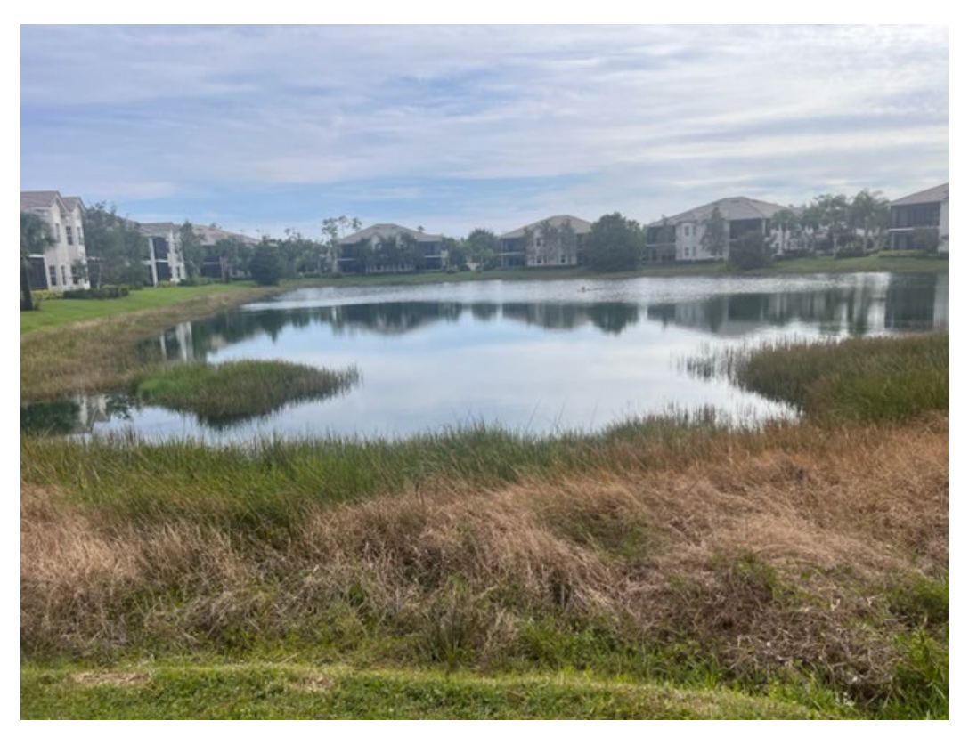
Grasses that need attention in San Marino Lake.