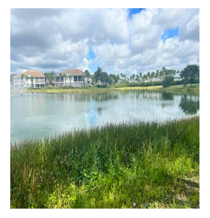
Lake Condition of Lake 6G