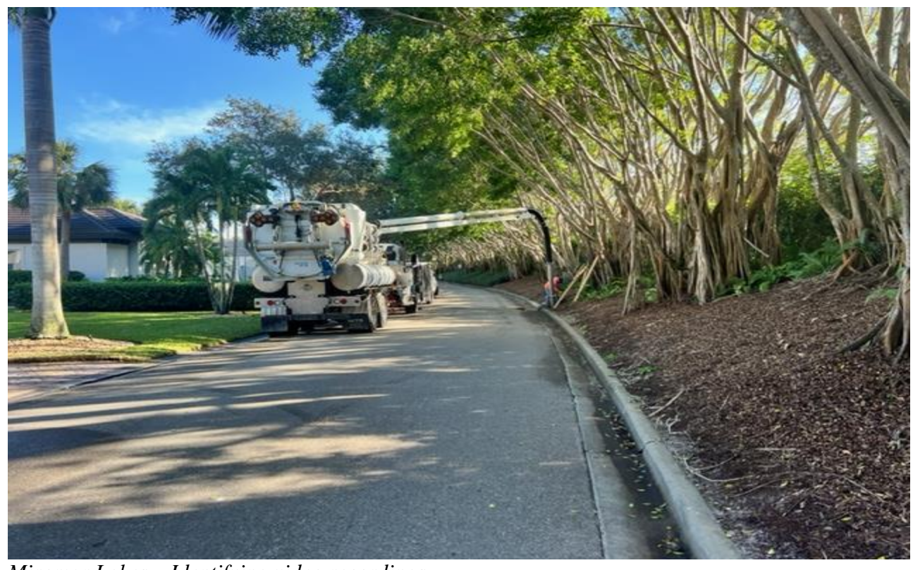
Miromar Lakes – Identifying video recordings