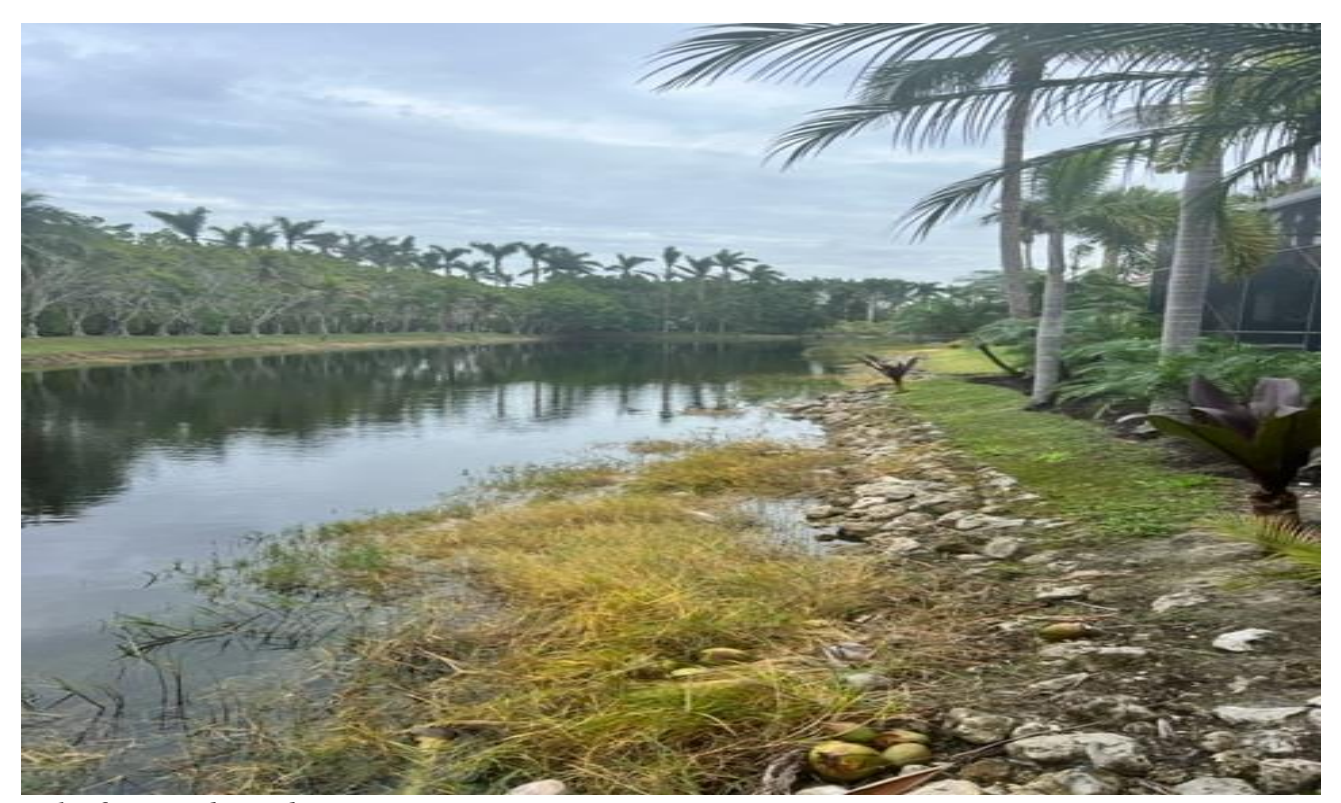
Lake 6 Treated Weeds