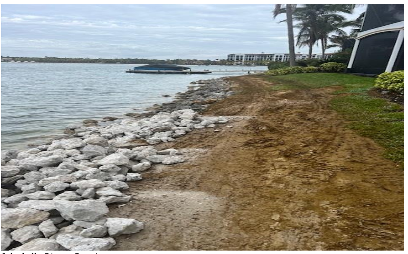
Iolsabella Riprap Repair