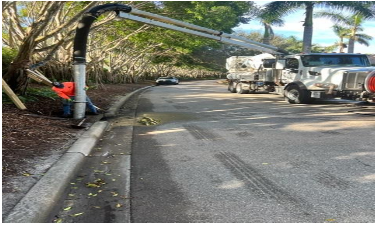
Miromar Lakes – Identifying video recordings