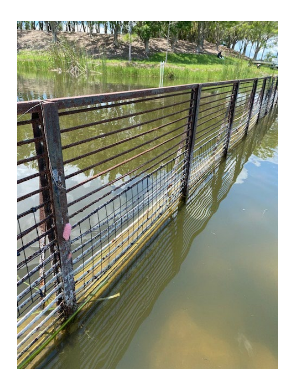
New Fencing Installed at Concrete Weir by FGCU