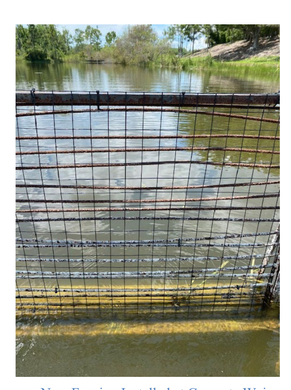
New Fencing Installed at Concrete Weir by FGCU