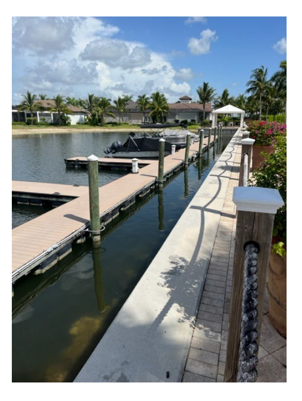
Marina Eel Grass (After)