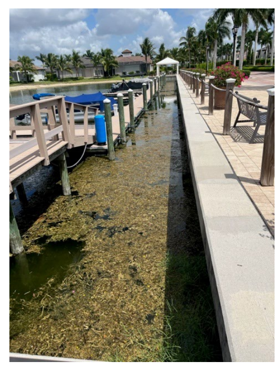
Marina Eel Grass (before)