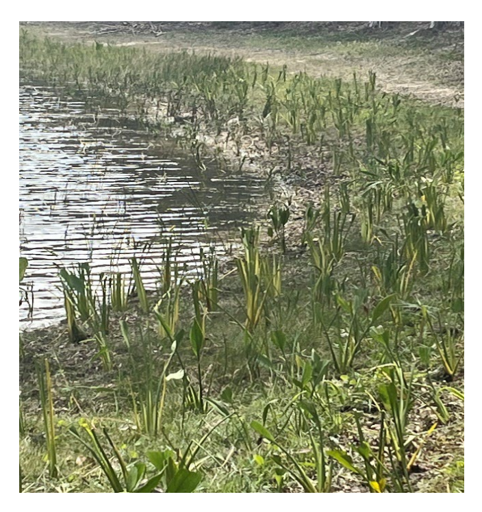
New Aquatic Plantings