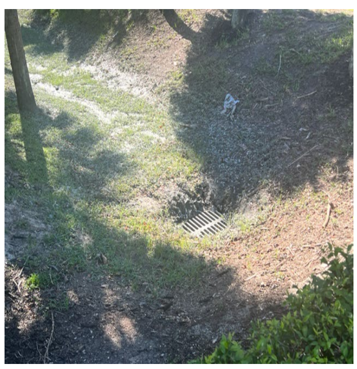
Laguna Catch-Basin Grate