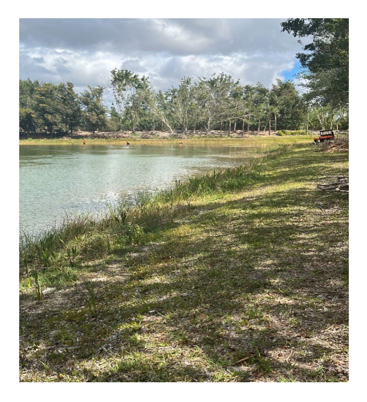
New Aquatic Plantings