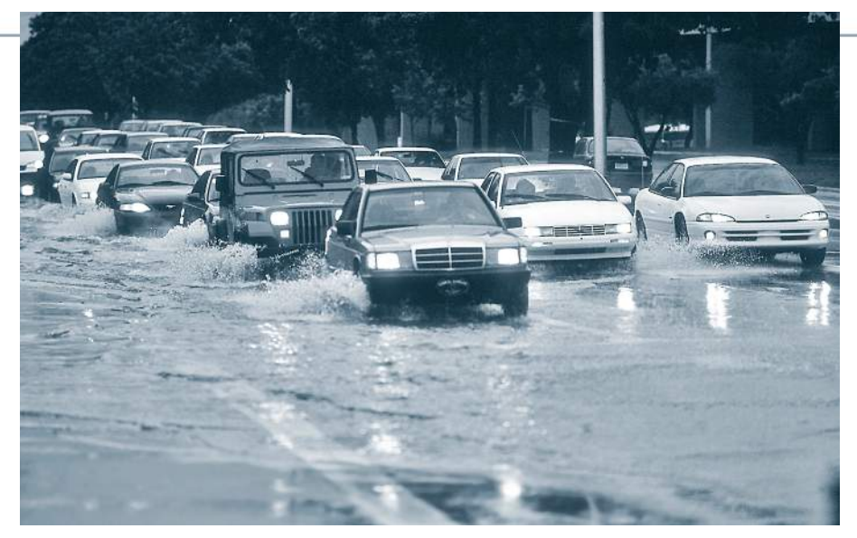
A road storm produces 4 to 6 inches of rainfall in a 24-hour period. Due to our unique climate and geography, standing water is normal and can be expected after a heavy rainfall.

property can transport excess nutrients from fertilizers or animal wastes, herbicides, pesticides, oil, gasoline or other substances that can pollute water and cause problems downstream. Wetlands are vital natural resources protected by the state. They provide for wildlife habitat, flood protection, groundwater recharge, and water quality benefits.